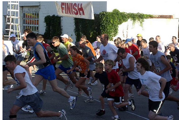
Annual 5K/10K Run

We sponsor several events throughout the year. These range from the Adult Reading program, Summer Reading Programs and Festival of Mini-Trees. Our largest fundraising opportunity comes in June with our annual 5K-10K Run in conjunction with Tonganoxie Days. June 2007 marked the 20th anniversary of the Run. Gift basket raffles are held periodically throughout the year.