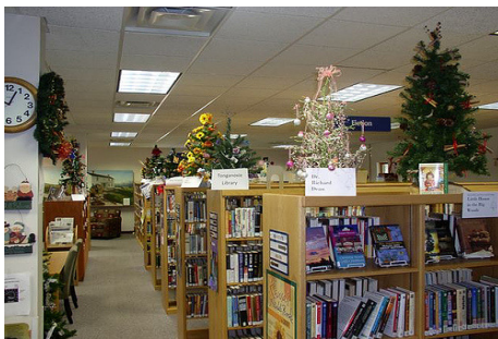
Festival of Mini-Trees

Friends of the Tonganoxie Library have been in existence since the late 1880's. At that time a group of community ladies started with a small collection of books for lending. This grew into a larger library that was once housed in our current city hall building. As the library grew a librarian was hired and a Friends group continued. Our current Friends group has approximately twenty members.